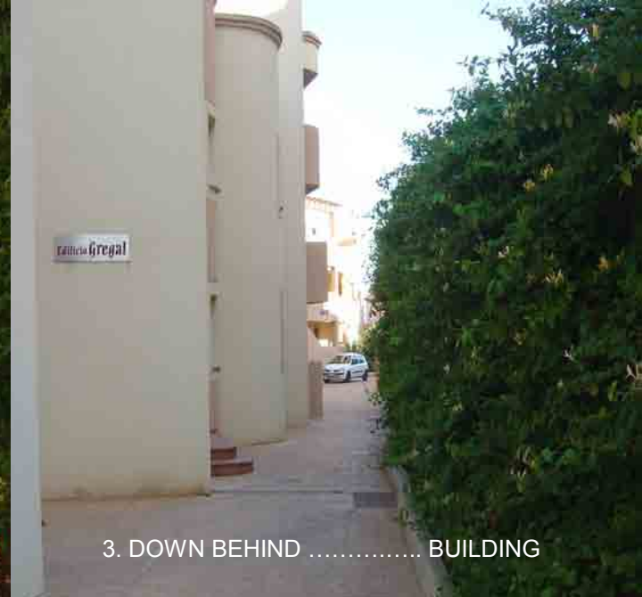
3. DOWN BEHIND ..... BUILDING