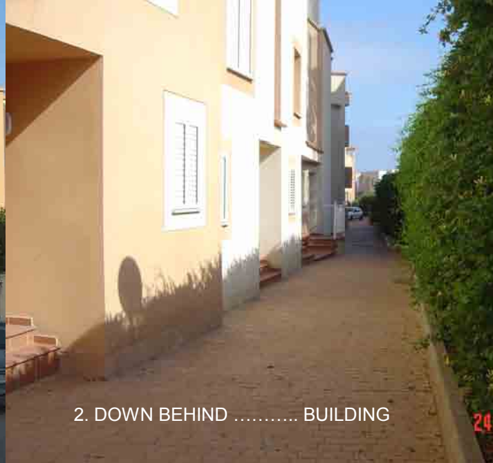
2. DOWN BEHIND ..... BUILDING