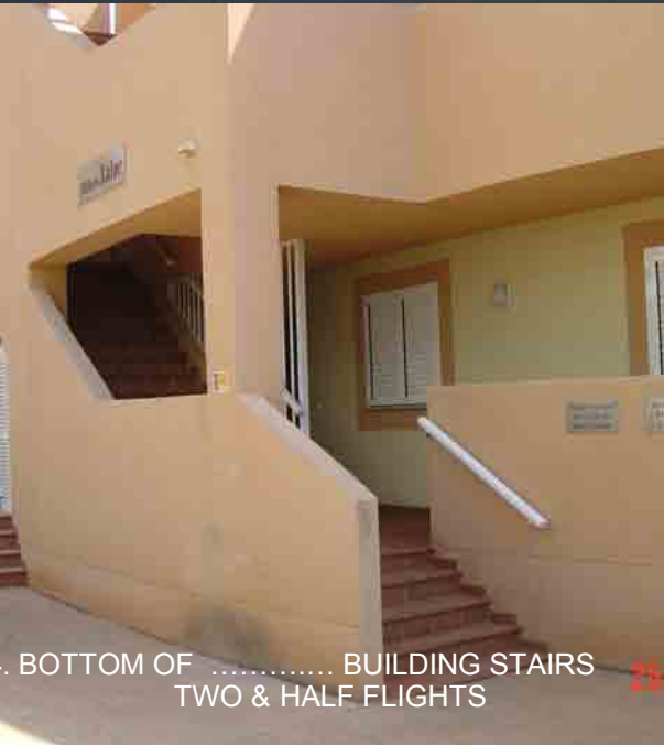
4. BOTTOM OF ..... BUILDING STAIRS TWO & HALF FLIGHTS