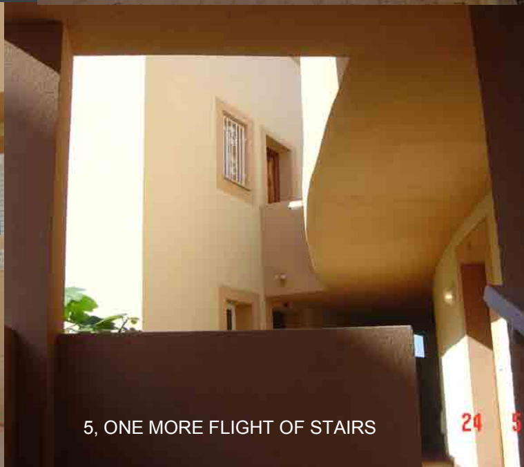
5, ONE MORE FLIGHT OF STAIRS