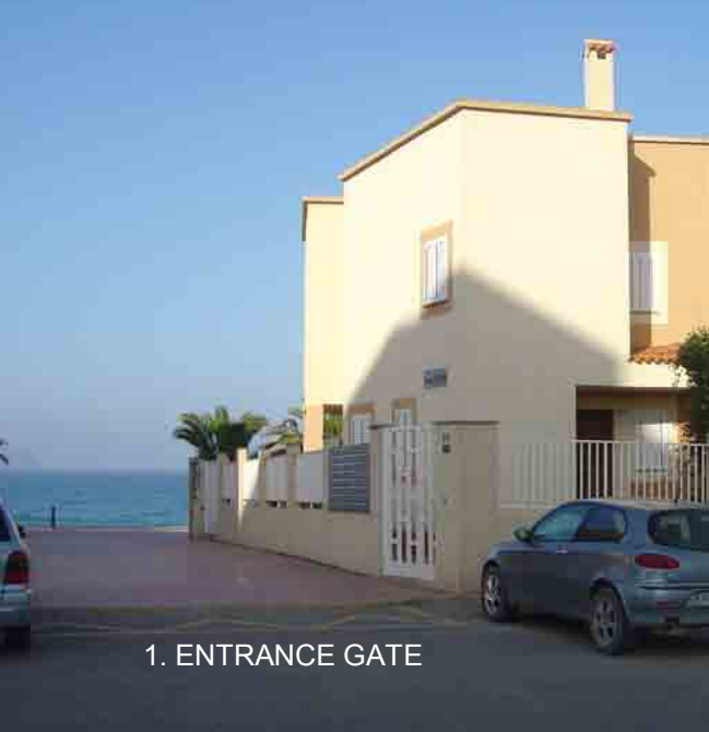
1. ENTRANCE GATE